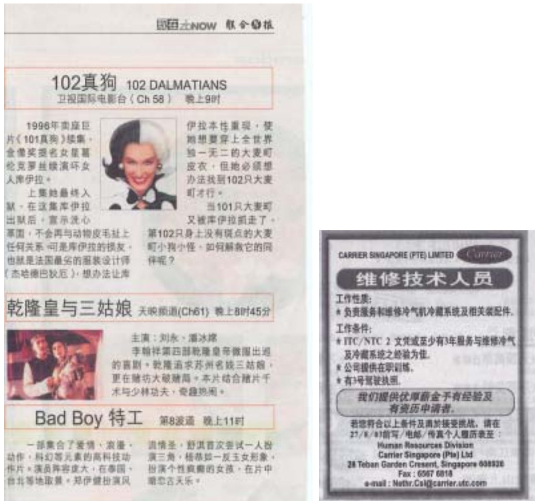
Figure 6 titles with border and shading

The left one of Figure 6 shows that titles are bordered with rectangle. And in the right one of Figure 6 the subtitles are shaded and bordered with round rectangle. Above contents are from Zaobao newspaper as well.