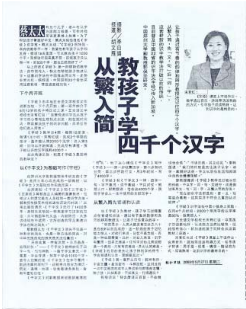
Figure 1 Mixture of vertical and horizontal lines